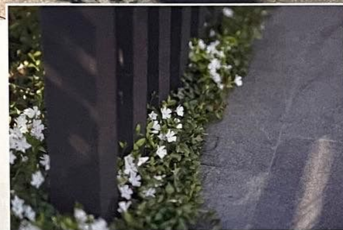
Previous page: View of the lawn, surrounded by planting