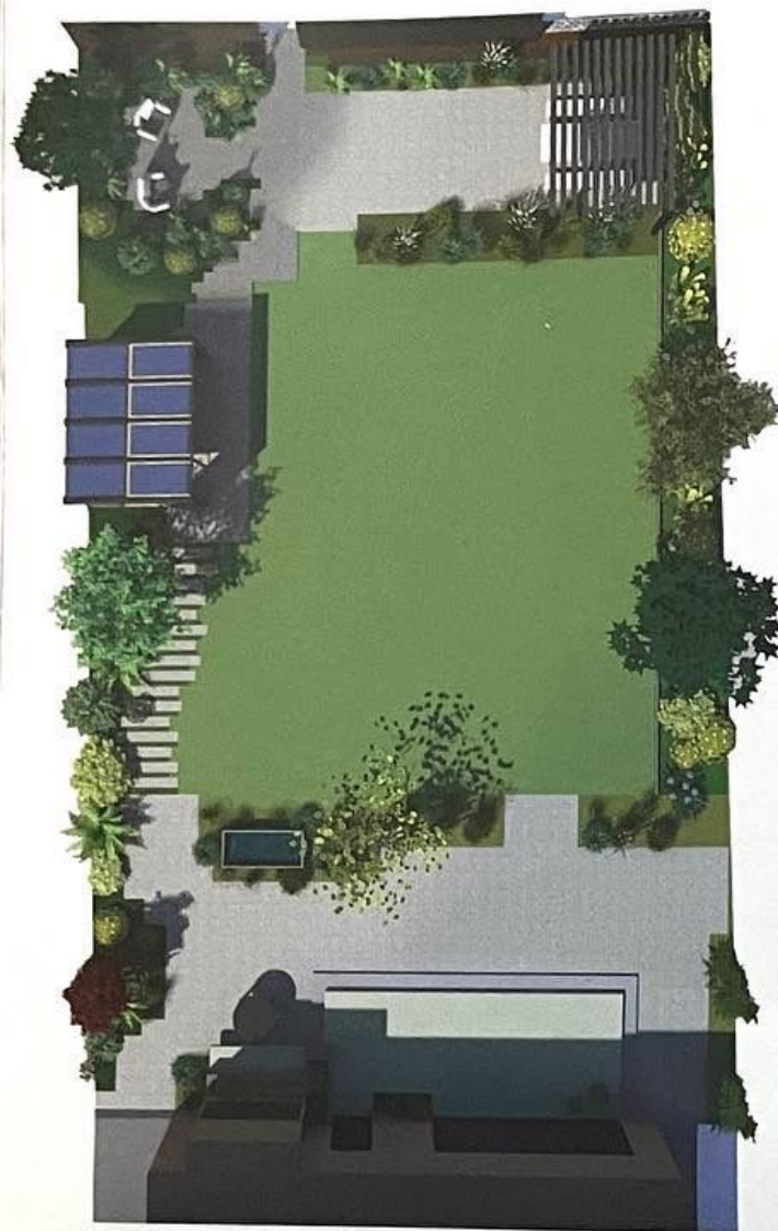
DESIGN: EMILIE BAUSAGER

The brief from the client was to create a modern, functional garden for entertaining the couple's large family with several spaces for seating and socialising. The interior of the home has industrial detailing and the garden needed to also include elements of industrial textures to create cohesion between the indoor